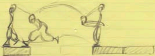
STARTING (2-SPACE) JUMP (initially covers for 3 spaces)

Can control this by pulling back on 3rd (A). Nearly need to go to B. Need to find → key msg.